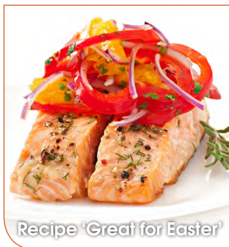
Recipe 'Great for Easter'

Place butter & oil in a frying pan over medium heat. Cook until butter is foaming and add capers and lemon rind. Cook until capers are crisp (approx 5 mins). Season. Drizzle over salmon and garnish with chopped parsley. Serve.