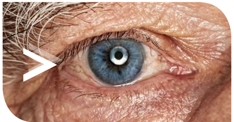
Sun damaged eye