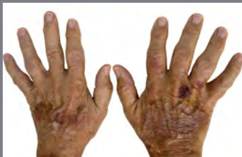
> Inflamed Joints