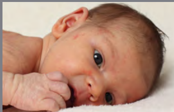
> Eczema and the Skin Barrier