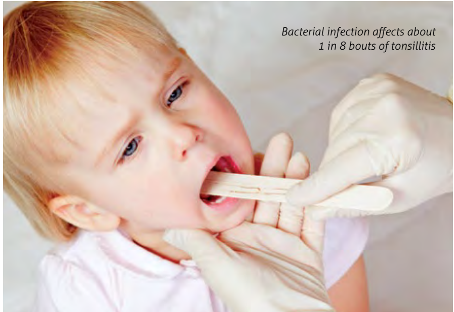
Bacterial infection affects about 1 in 8 bouts of tonsillitis

In previous generations, removing tonsils was common. Today they are only removed