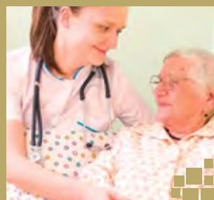
Stroke and When to Call 000