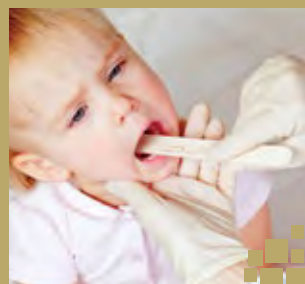
Is it Tonsillitis?