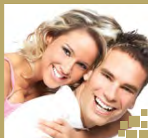
STI Testing is Easy